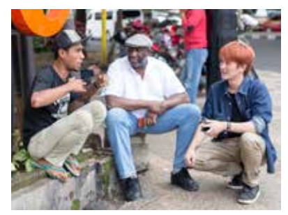
African and Asian Culture