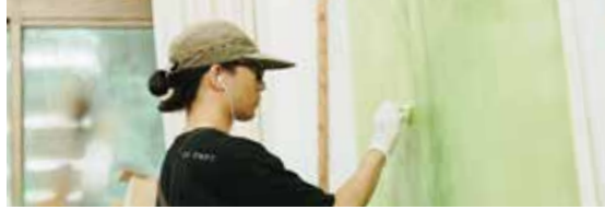
Department of Fine Arts