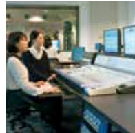
Audio Effects Studio