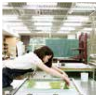
Silk-screen Printing Studio