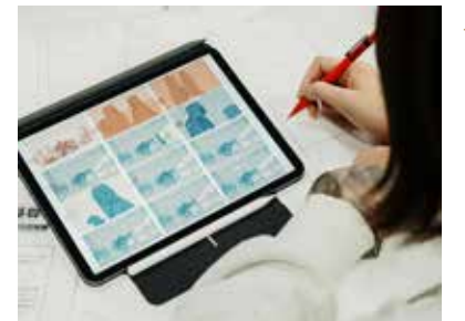
Department of Manga

From professional instructors who are leaders in the Japanese animation industry, students learn animation systematically and comprehensively. In addition to gaining hand drawing skills, they acquire expertise in computer graphics techniques. The course facilities include dedicated working space, a high-level sound studio, and digital drawing tools.