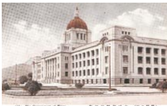
The Korea Government General Offices, Seoul (Keijo). In 1996, during the Presidency of Kim Young Sam, this building was demolished in a frenzy of national pride.