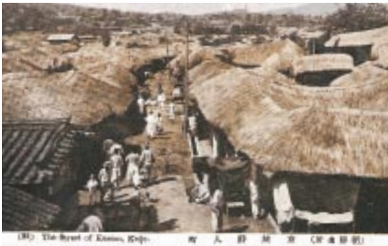
“The Native Quarter” Seoul (Keijo)