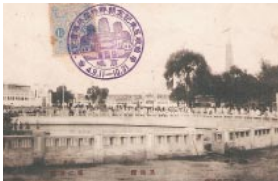
The Korea Exhibition of 1915 (Taisho 4), held in Seoul, commemorated the five years of Japanese annexation.