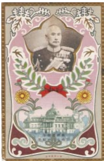
A 1918 memorial card, bearing the portrait of the Japanese Governor commemorates 7 years of Japanese colonial rule in Korea