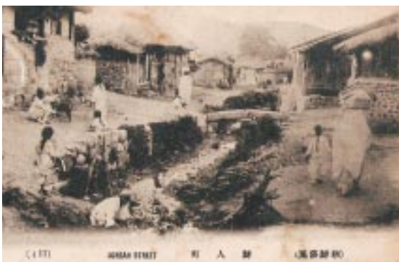
“Korean Street” in Kyongju